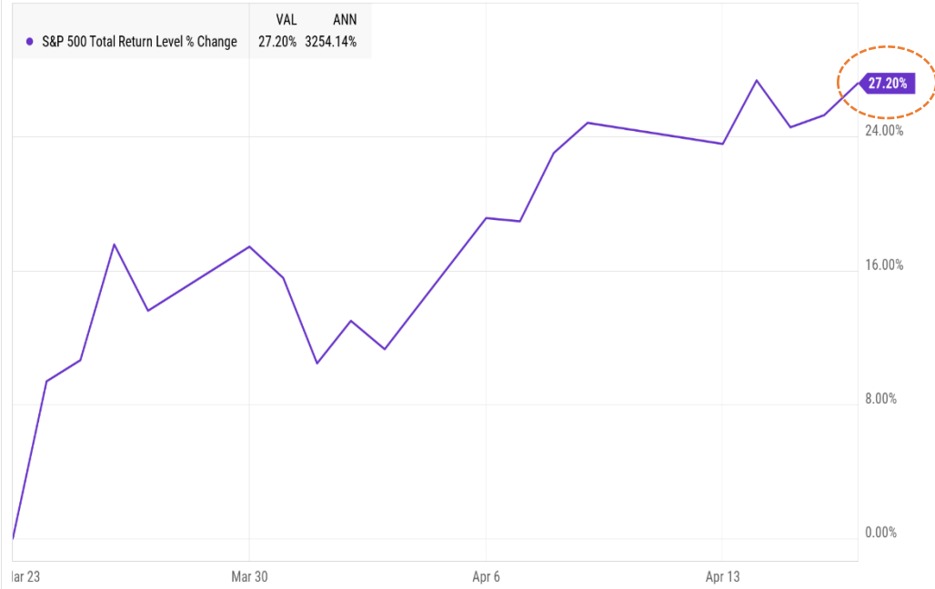
Stock Market Return <1 Month