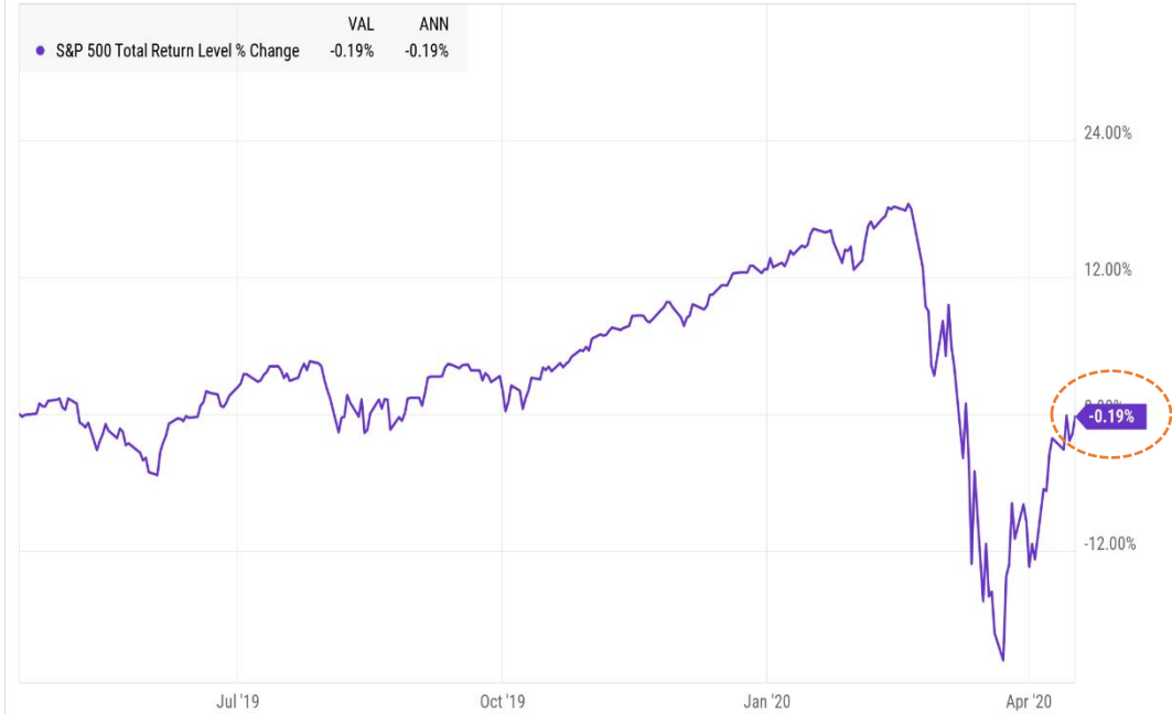
1 Year Stock Market Return